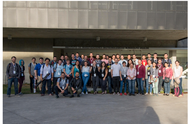
Figure 1. Delegates who attended to the second LA-SCS 2016.

Abstracts of poster presentations are available online in the symposium booklet ( http://lascs2016.iscb.org/lascs2016-booklet ).