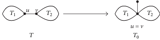
FIGURE 1: The edge-growth transformation.

Proof. Suppose, on the contrary, that there is a path xv_1 \cdots v_t y in T such that d_T(x) = 3 , d_T(y) = 3 , d_T(v_1) = \cdots = d_T(v_t) = 2 , and t \geq 1 . Let M be the perfect matching of T ; we consider the following two cases.