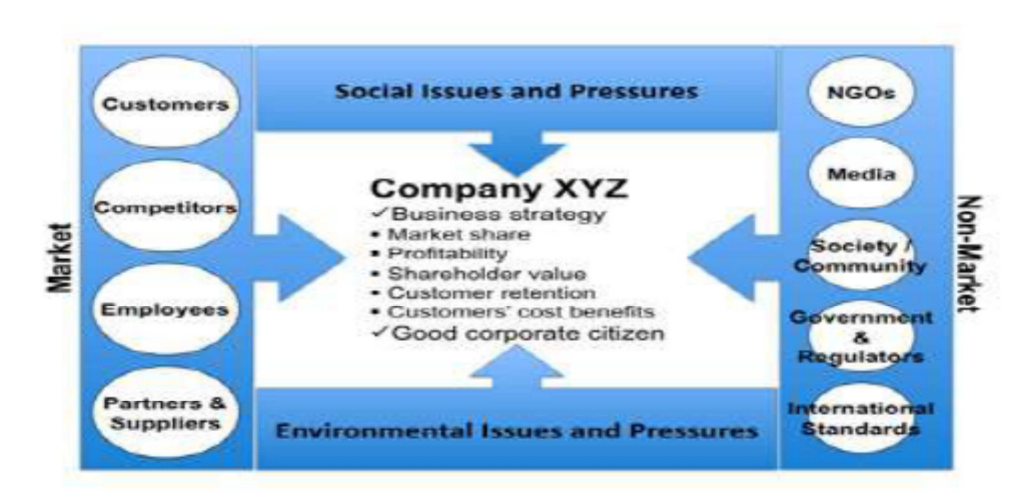
Figure 2. Market and Non-market Environments

On the other hand, the non-market elements are everything that affects the market indirectly. Also unlike the market characteristics, non-market's characteristics (see the following Figure 2) are that they: vary from place to place, are immeasurable, information is the medium, and the rules are mainly complicated and hard to deal with. Here, the Governments, regulators, media, NGOs, citizens, activists are the elements of the non-market environment (Baron 1995a, 1995b, 1997, Yuanqiong, Zhilong & Yun 2007, Zhilong & Haitao 2006, Marc & Patrick 2005).