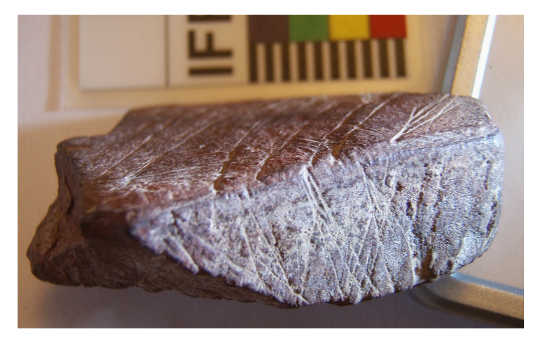
Figure 5. Stone plaque almost completely covered by engravings, Wonderwerk Cave, c. 70,000 years old.

Before discussing the final class of palaeoart objects, beads and pendants, one unusual object is to be considered. An anthropomorphous dolomite piece from Mumbwa Caves, Zambia, is the only proto-figurine so far proposed for the MSA (Barham 2000) [4]. Deposited during the OIS5e interval, i.e.