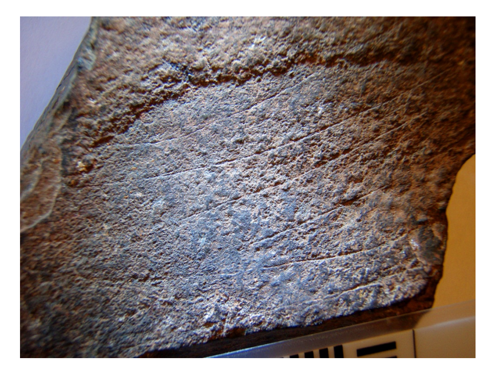
Figure 4. Stone plaque bearing seven engraved lines from Wonderwerk Cave, South Africa, c. 300,000 years old.