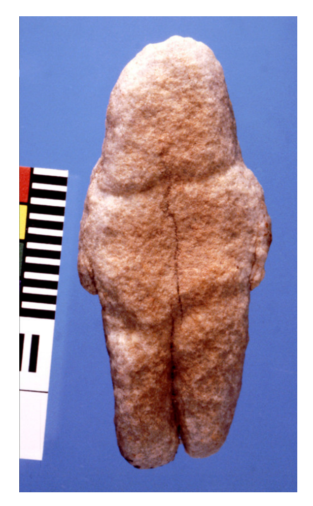
Figure 2. The Tan-Tan proto-figurine, Morocco, a natural object that was modified to emphasise its human form during the middle Acheulian.

The Tan-Tan proto-sculpture from a fluvial terrace deposit on the north bank of the River Draa in southern Morocco is from a rich assemblage of middle Acheulian lithics, which in this region are in the order of between 300 and 500 ka old (Figure 2). The quartzite object is of natural form, but has been modified. Five of symmetrically located eight grooves that emphasise its human form were made by careful impact, and traces of haematite suggest that it was once coated in red colour (Bednarik 2001, 2003b) [45,50]. It is one of only two known proto-sculptures of the time, the second being the probably slightly younger late Acheulian specimen from Berekhat Ram, Israel (Goren-Inbar 1986; Goren-Inbar & Peltz 1995) [104,105]. That period has also yielded a manuport from Morocco, the Triassic Orthoceras sp. cast from Erfoud site A-84-2 in the Sahara near the eastern border of the country (Bednarik 2002a) [46]. This fossil cast resembles a human penis closely and was found in the remains of a stone-walled dwelling or windbreak, together with Acheulian tools (Figure 3). Although such fossils are very common in northern Morocco, they do not occur naturally in this region.