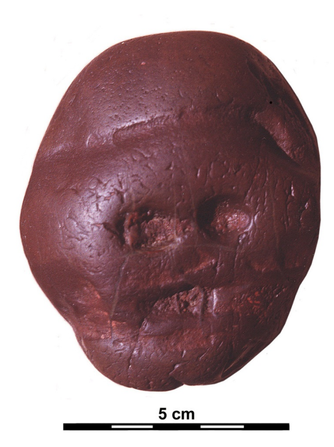
Figure 1. The Makapansgat cobble, South Africa, carried to a cave and deposited almost 3 million years ago.

In contrast to the comprehensive early appearance of pigment use, mostly from the continent's south, Acheulian beads are so far limited to those of one site in the north. The ostrich eggshell beads from the Late Acheulian of El Greifa, Libyan Sahara, are about 200 ka old according to Th/U dating