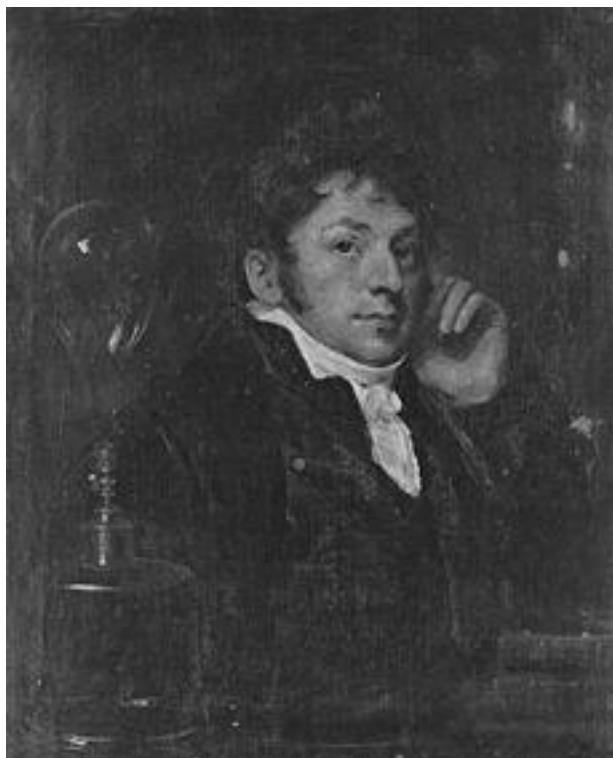
Black and white photograph of an oil painting by Samuel Drummond en.wikipedia.org/wiki/Friedrich_Accum

It is clear that the current fashion of ‘naming and shaming’ 13 is nothing new. The book’s original cover was light green with white designs of snakes writhing around a rectangle enclosing a spider’s web, in which a large spider was terminally embracing a fly. Above there was a banner showing a skull and cross-bones with ‘There is Death in the Pot’ written underneath. 14 The first edition of a 1,000 copies was sold out within a month and the second edition appeared later that year. Unsurprisingly perhaps, he received a number of threatening but anonymous letters. An American reprint appeared in Philadelphia in 1820 and a German translation in Leipzig in 1822.