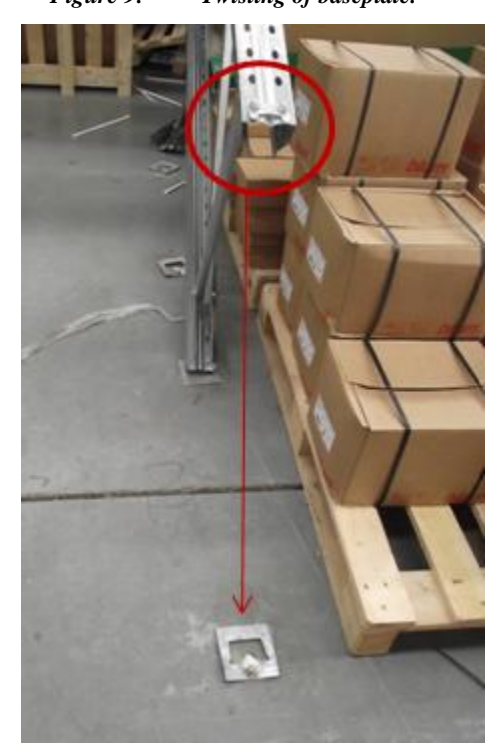
Figure 10: Failure of baseplate to upright post connection.