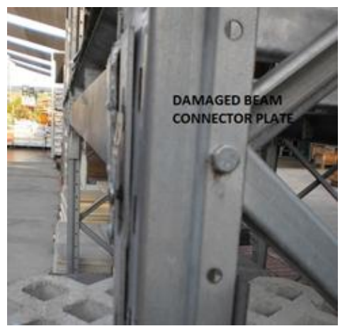
Figure 8: Damaged beam connector plate.

Figure 7: Sheared off beam locating hook.