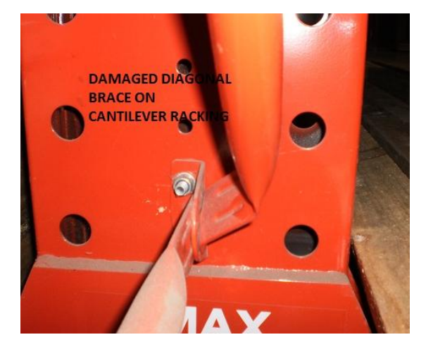
Figure 11: Damaged diagonal bracing elements.

Figure 11 shows failure modes in the bracing elements. It is advisable to replace buckled braces and check carefully for cracks in the supporting connection into the column wall and locally in the column wall itself.