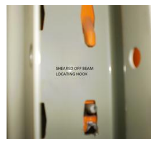
Figure 7: Sheared off beam locating hook.