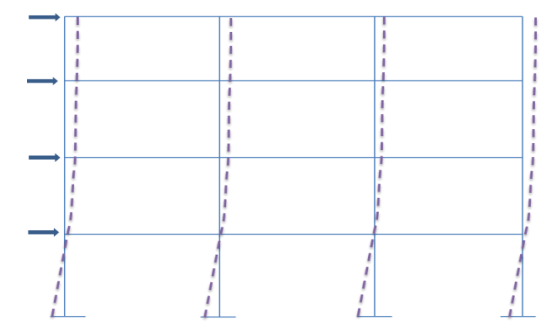
Figure 3: Vertical out-of-plumb with bow effect in the upright members.

attached to the base plates and rotation at the beam/column connections could result in vertical out of plumb deflection and a deflected profile in the form of a 'bow'. The out-ofplumb damage is more likely to be visible at the bottom member than in the upright members in the upper levels.