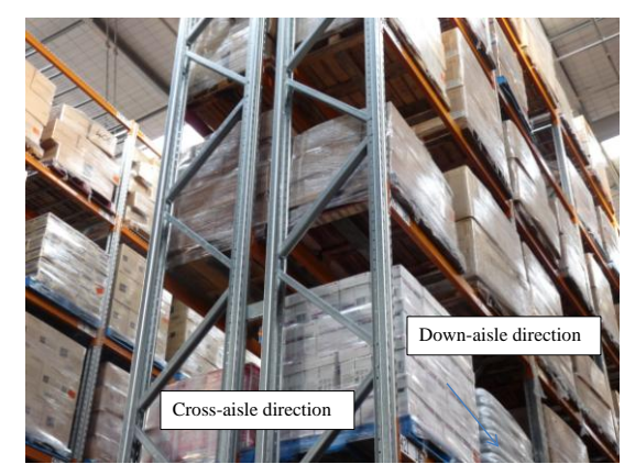
Figure 2: Typical pallet racking storage system.