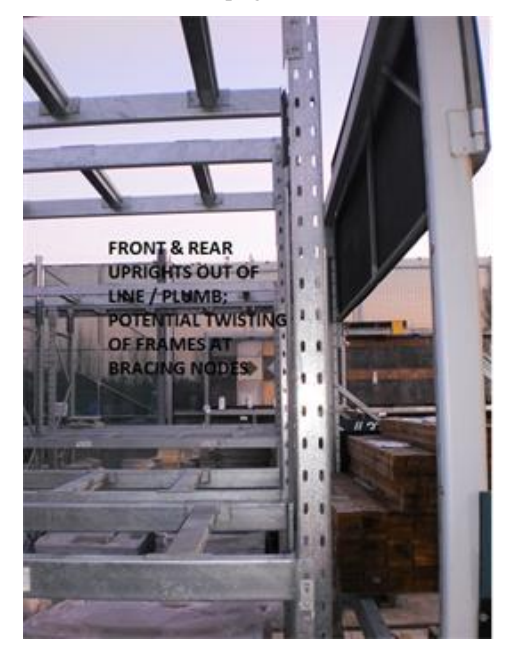
Figure 4: Out-of-plumb in front and rear upright members.

Also, out of plumb damage in upright members as shown in Figure 4 could result in possible twisting of the upright posts at bracing nodes and/or rotation of moment connections between the beams and the uprights.