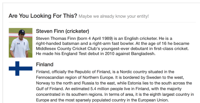
Figure 4: Alternative entities named Finn