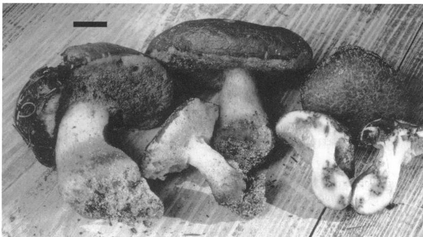
FIG. 1. Basidiomata of Boletus abruptibulbus , HOLOTYPE, Both 4588 (BUF). Scale bar = 15 mm.