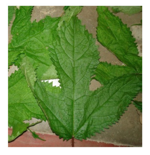
Fig. (1). Girardinia heterophylla leaves from Mussoorie hills of Uttarakhand (India).

petroleum ether: ethyl acetate (93:7) having Rf value = 0.60. It gave a positive reaction in the Liebermann-Burchard test and was soluble in chloroform. The unknown compound was analyzed by GC-MS and it shows the retention time at 21.642.