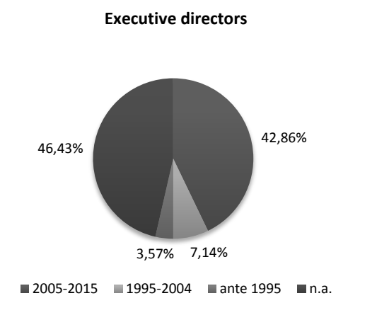
Figures 3 and 4. First nomination of board members, outsider systems companies

Generally, the older members are part of founder families and this situation explains their role as executive directors.