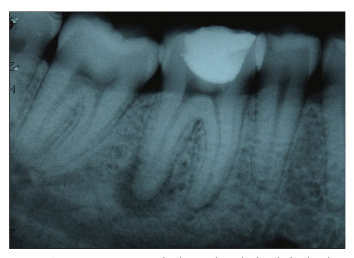
Figure 2. Preoperative periapical radiographin which only the distal canal of the first right mandibular molar was included in the experimental group. Note the forth right periapical radio lucency. APAI-5 score was assigned