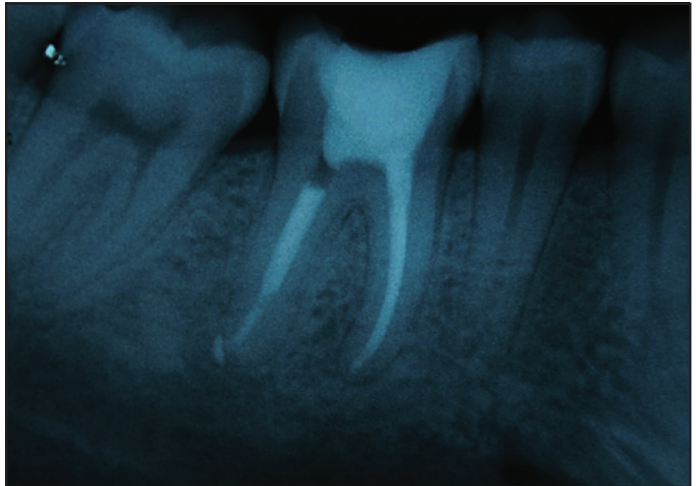
Figure7.Finalradiographat9monthsaftercompleteobturationwas done. The patient was scheduled to definitely restoration

working length again. All canals were obturated using gut-tapercha and zinc oxide eugenol sealer by lateral compaction technique after the sealer was spun into the canals with the aid of a lentulo spiral and taking care of compacting as best as possible the apical third. In the experimental cases, another experienced endodontist removed the root canal filling with the F5 file at 4 mm less to the full length confirmed by a radiograph (Figure 3). This second intervention by another endodontist was performed at the same appointment with the objective of keeping the first endodontist blind to the objectives of the study. The excess cavities of all cases were filled with an in-termediate restorative material (Dentsply/Caulk, Milford, DE, USA). All patients were advised to take 400 mg of ibuprofen every 8 hours for 3 days and to attend the university clinic at any time in case of pain, swelling or any discomfort. Everyone agreed to attend the follow-ups, first at one month and then every 3 months during 2 years.