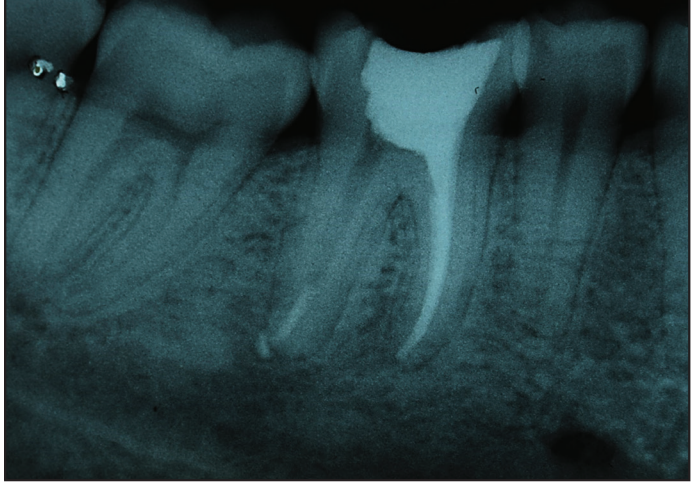
Figure6.After9monthsoffollow-upradiograph,itwasclassifiedwitha PAI-2 score, so the trial finished to the patient

The instrumentation was finished using one or more of the ProTaper (Dentsply Maillefer, Ballaigues, Switzerland), finish-ing files, F1, F2, F3 or F4. The canal was irrigated with saline solution and the patency was confirmed again. The root ca-nals were dried with sterile paper points and irrigated with 17% ethylene diamine tetra-acetic acid during 5 minutes. A final irrigation was done with NaOCI and a confirmation of the