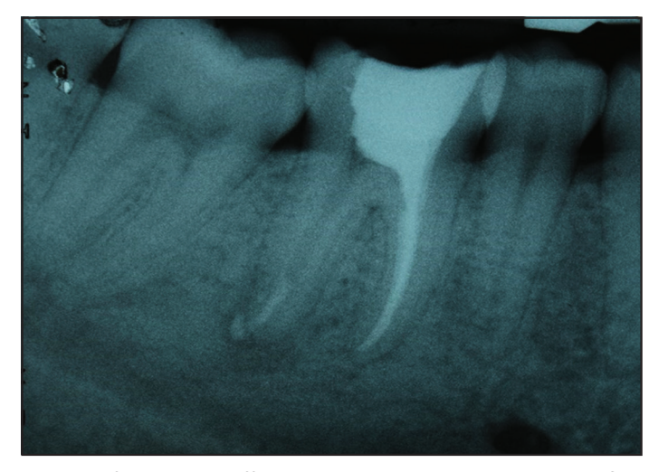
Figure 5. After 6 months offollow-upradiograph, the case was classified with a PAI-3 score

ing with copious irrigation of 2.5% NaOCI. The working lengths of the root canals were determined with size 15 stainless steel hand files and a Root ZxII electronic apex locator (J. Morita and Co, Tustin, CA, USA).