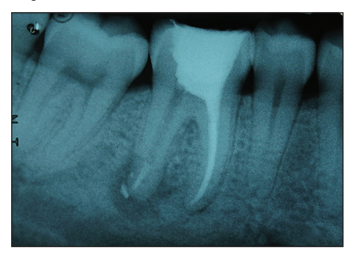
Figure 3. Immediate postoperative periapical radiograph. Note the desobturation at 4 mm less to the full length