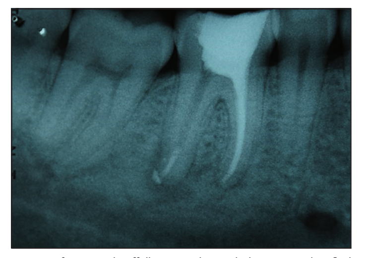
Figure 4. After 3 months of follow-upradiograph, the case was classified with a PAI-3 score