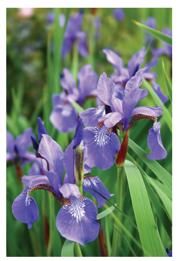
Iris versicolor of the Iridaceae family

Many nutrients and herbs that have not been the subject of randomized controlled studies are used regularly by clinicians. They have also been used traditionally for hundreds, sometimes thousands of years.