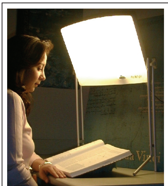
FIGURE 2. Bright light therapy set-up for 10,000-lux illumination*

The patient's initial trial of light therapy will almost always occur in winter after the depression has become severe. If the treatment is effective, one needs to decide when to resume it in subsequent years—proactively, while the patient still feels well early in the season, or only after symptoms recur. Either method will work but both solutions have negative aspects. If treatment is proactive, there is a chance it will be unnecessary because the patient is “skipping” a winter. Such skipping may explain why, in a comparison of treatment begun before or after symptom onset, the proactive group showed fewer symptoms throughout the winter. 95 Indeed, the regularity of winter recurrence has been questioned, 96-100 and it is common in clinical trials that patients who fulfill retrospective diagnostic criteria for SAD do not necessarily become depressed during the year of the study. On the other hand, one wants to avoid the suffering of relapse. A solution is to coach the patient to detect reliable precursors of winter relapse, such as difficulty waking, daytime fatigue, and carbohydrate craving, 99-101 and begin treatment only once they occur.