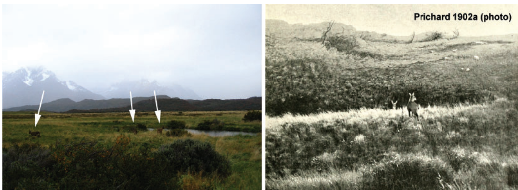
Fig. 3. Past and current use of open and flat habitat by huemul, far from forests and cover. Note that such habitat is used during full daylight hours.

The current absence of huemul from low-elevation portions of mountains is claimed to be natural and related to huemul being a mountain-top species. Anthropogenic displacement from low-elevation habitat has been pre-empted by claims that huemul was not an interesting game species to humans because deer occurred only at very low densities and in high-elevation mountains. Whereas these arguments are based on characteristics of extant populations, an additional argument is based on the nutritional value of the huemul. Thus, after analysing anatomy in terms of energy economy for two fresh carcasses, Belardi and Otero (1998) concluded that huemul was not important to hunter-gatherers because of the leanness of the meat, with bone marrow considered to be the only source of fat. Unfortunately, these authors neglected the fact that these samples were particularly incomplete regarding fat because these animals were skinned and eviscerated before analysis, and thus the most relevant portions were discarded. Others also focussed on bones, emphasising low utility of meat lacking fat, but omitting the issue of dissectable fat (e.g. De Nigris 2004). However, these interpretations about the utility of huemul