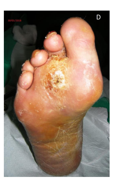
Figure 3. Case No. 3. (A,C,D) Different moments of the wound healing, stable after six months; (B) NMR with the bone lesion at the third metatarsal ray.