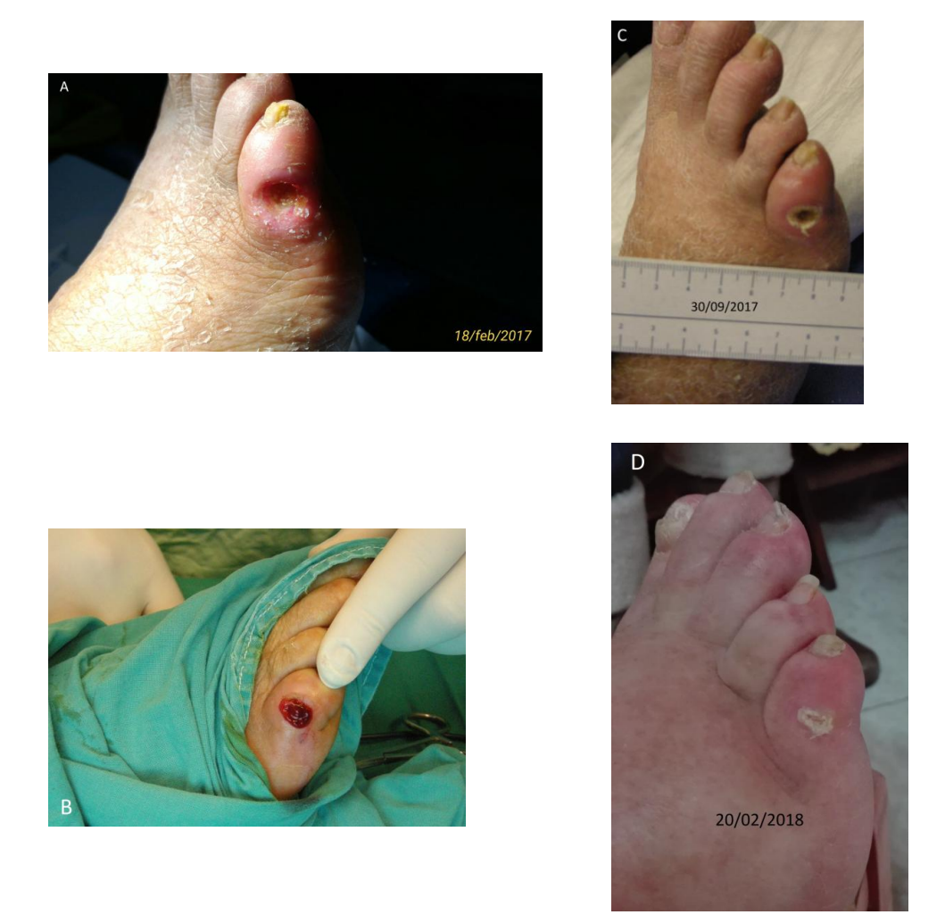
Figure 2. Case No. 2. ( A , C , D ) Different moments of the wound healing, stable after one year; ( B ) The lesion after L-PRF grafting.