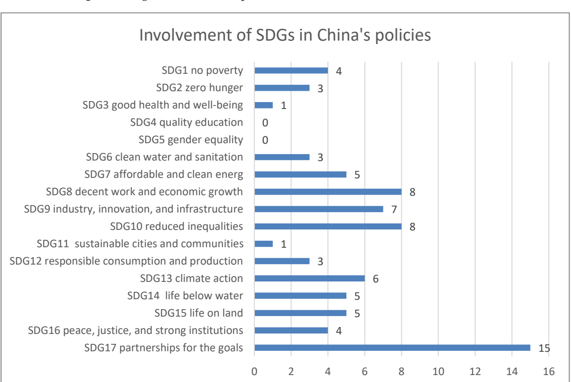
Figure 1. Alignment of China's policies towards LAC and the BRI with 17 SDGs.