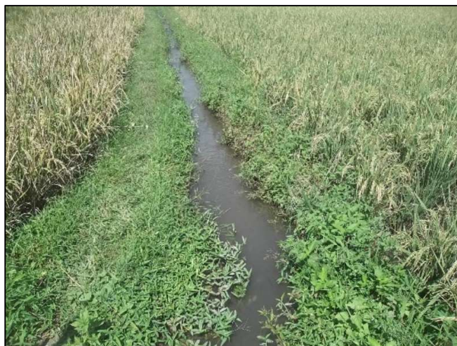
Figure 4. Mature rice plant in the upper area receives too much water due to poor irrigation canal condition

The establishment of irrigation infrastructures can be funded by mobilizing farmer's resources, high farmer WTP indicates that farmers are likely to be willing to participate in those decision. Since, the establishment of irrigation infrastructure will increase irrigation efficiency, increase water availability, and lowering the cost of irrigation. As stated by [16] the availability of canal water strengthens social capital among water user and makes WUA more dynamic.