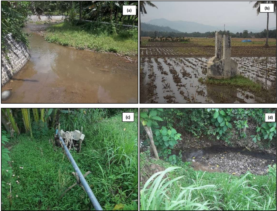
Figure 1. Irrigation system in the studied area. (a) Agung dam, the main water reservoir; (b) Farmer digging well; (c) Private water pump ; (d) Irrigation and drainage canal.