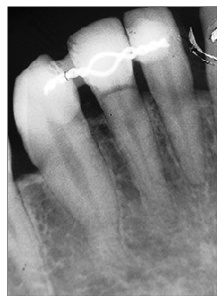
Figure 7. Radiographic control at three years showing probable consolidation process on the 1/3 coronal

Authors investigating this subject area are in agreement regarding the more frequent affliction of the upper central incisors, which are involved in >85% of trauma cases, due to their extremely forward position that renders them a 'bumper'; then, in decreasing order, there are the upper lateral incisors and the central lower incisors (1). In the present case, the patient exhibited misalignment of the lower incisor-canine set. The degree of movement depends on the severity of the trauma and the location of the fracture line. The movement can be considerable when the fracture is located in the coronal