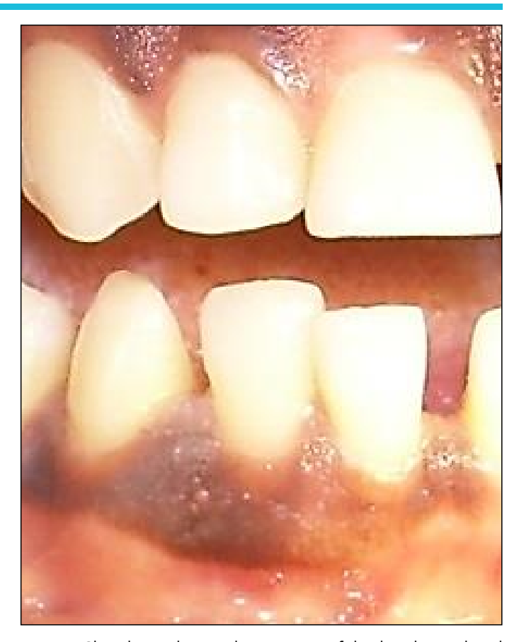
Figure 1. Clinical view showing the intactness of the dental-periodontal tissues

No medication was prescribed in light of the lack of functional signs. The patient was advised in regard to oral hygiene and eating, and a follow-up schedule was implemented. A check-up was carried out on day 15 and then every month up to the sixth month, followed by yearly check-ups. In these check-ups,