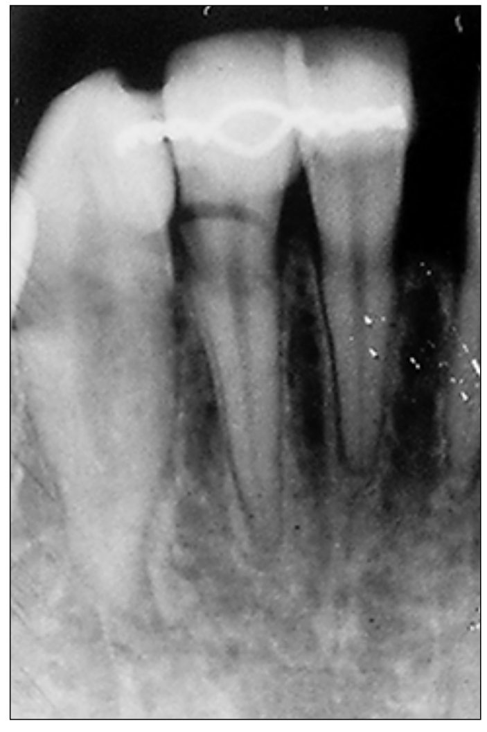
Figure 5. Radiographic X-ray at 6 months showing consolidation of the apical one-third fracture and absence of consolidation of the coronal one-third one

According to Machtou and Naulin (5), root fractures have diverse clinical presentations. The reduction of the fracture is more difficult than the movement of fragments is important.