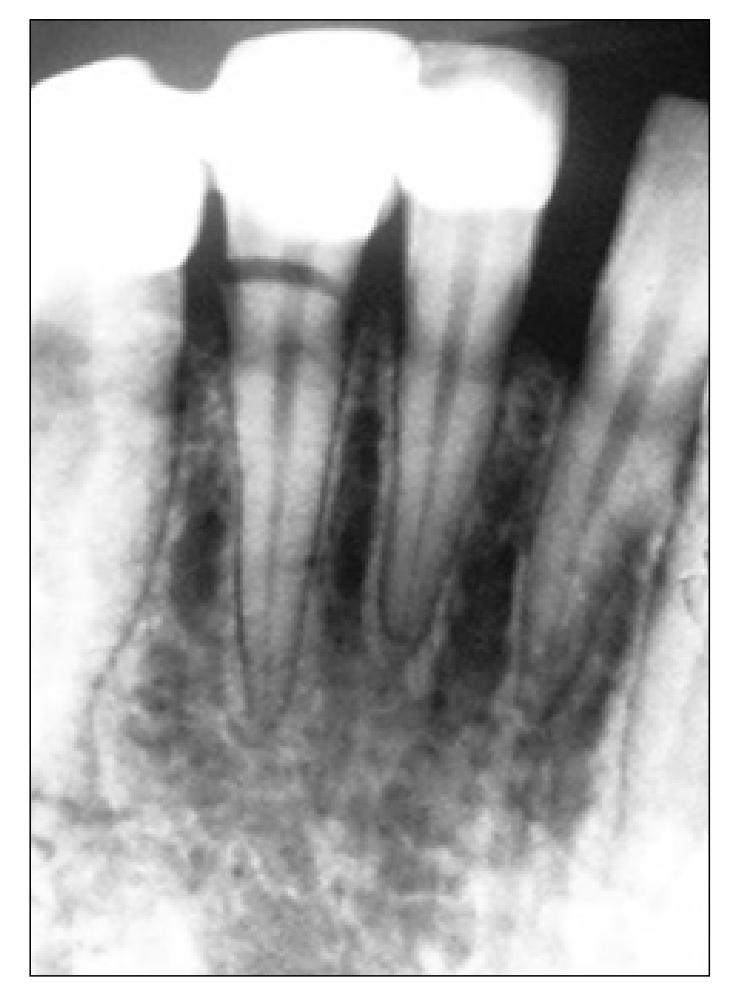
Figure 4. Radiographic X-ray control after splinting

The follow ups at days 30, 60 and 90 and 1 year, 2 years and 3 years revealed preserved pulp vitality, an absence of a fracture line in apical images, and no root resorption (Figures 6-8).