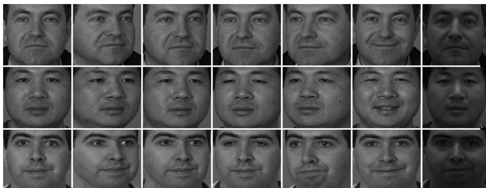
Fig. 3 Samples of the first three subjects in FERET database