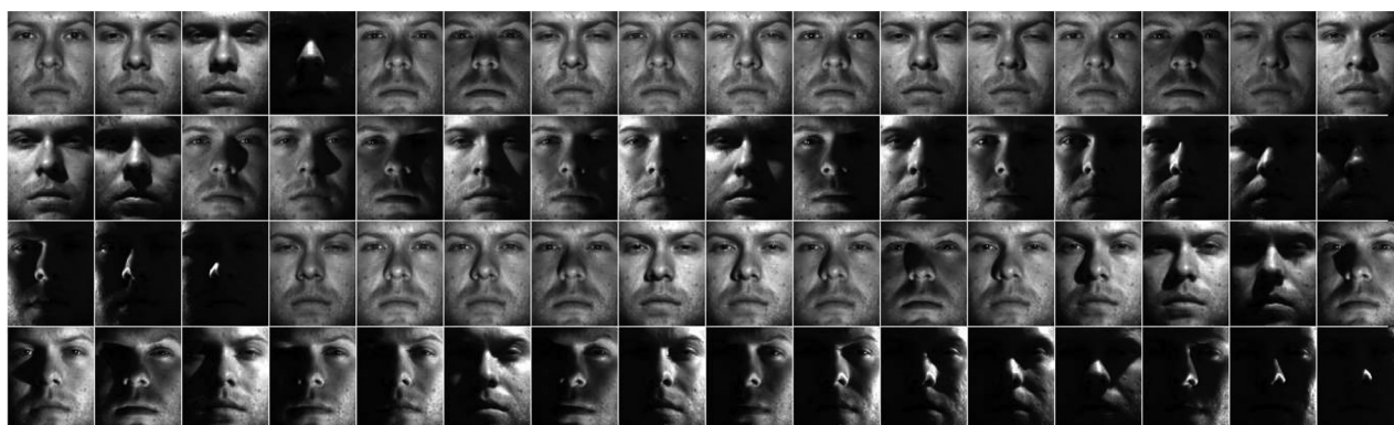
Fig. 4 All samples of the first subject in extended Yale B database