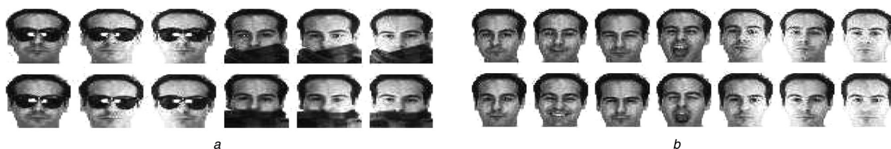
Fig. 5 Samples in ARD and ARE databases

From Table 4, it is easy to see that PLECR outperforms other methods for the experiments on ARD database, which indicates effectiveness of PLECR for face recognition with occluded conditions.