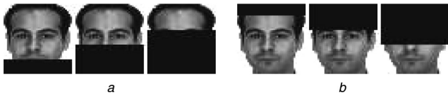
Fig. 6 Figure shows the first sample in ARE with different black occlusions varying from 20 to 60%

a Shows the samples with block occlusion from bottom to top b Shows the samples with block occlusion from top to bottom