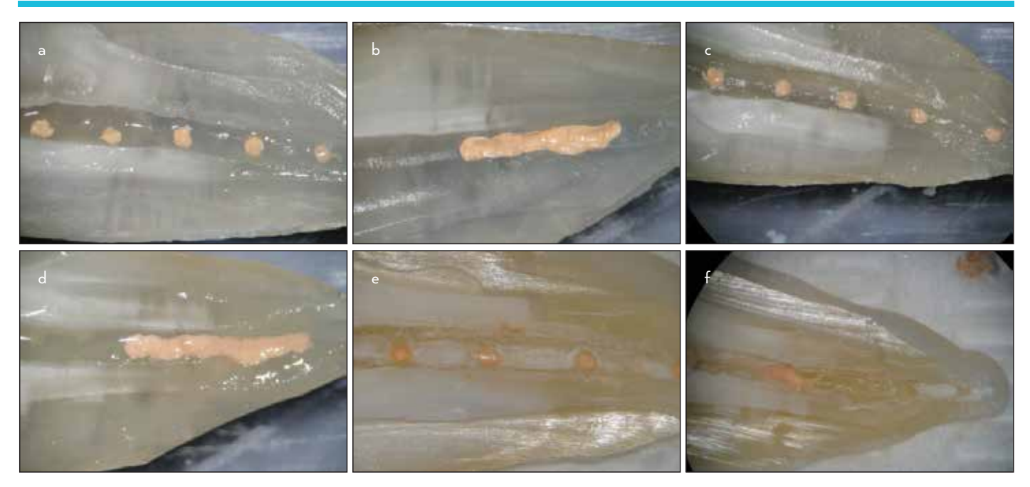
Figure 1. a-f. In vitro model and incomplete removal of gutta-percha and sealer in the depressions (a) and groove (b). Specimen before being tested, showing a complete filling with gutta-percha and sealer of the artificial un-instrumented areas: depressions (c) and groove (d). Specimen where NaOCI was activated using PUI for three cycles of 20 s. Depressions (e) and groove (f).