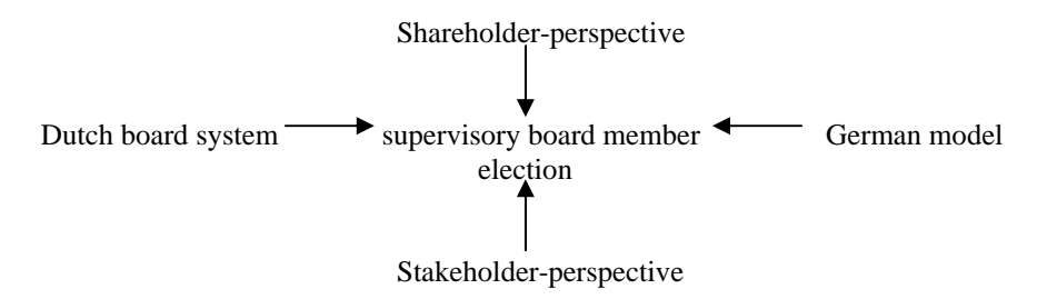
Figure 2. Contextual factors that have influenced the discussion on changing the co-option system

In the 1970s and the early 1980s, a period characterized by a relatively large amount of attention paid to employee participation, the discussion focussed for the greater part on employee involvement in the composition of the board and the working of the Dutch co-option system relative to the direct election model of the Aufsichtsrat in Germany. From that perspective, an extensive comparative analysis of the advantages and disadvantages of both the Dutch and the German board systems has been made (see e.g. Gelauff and Den Broeder, 1996).